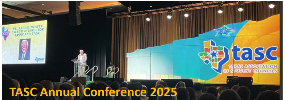
TASC Annual Conference 2025