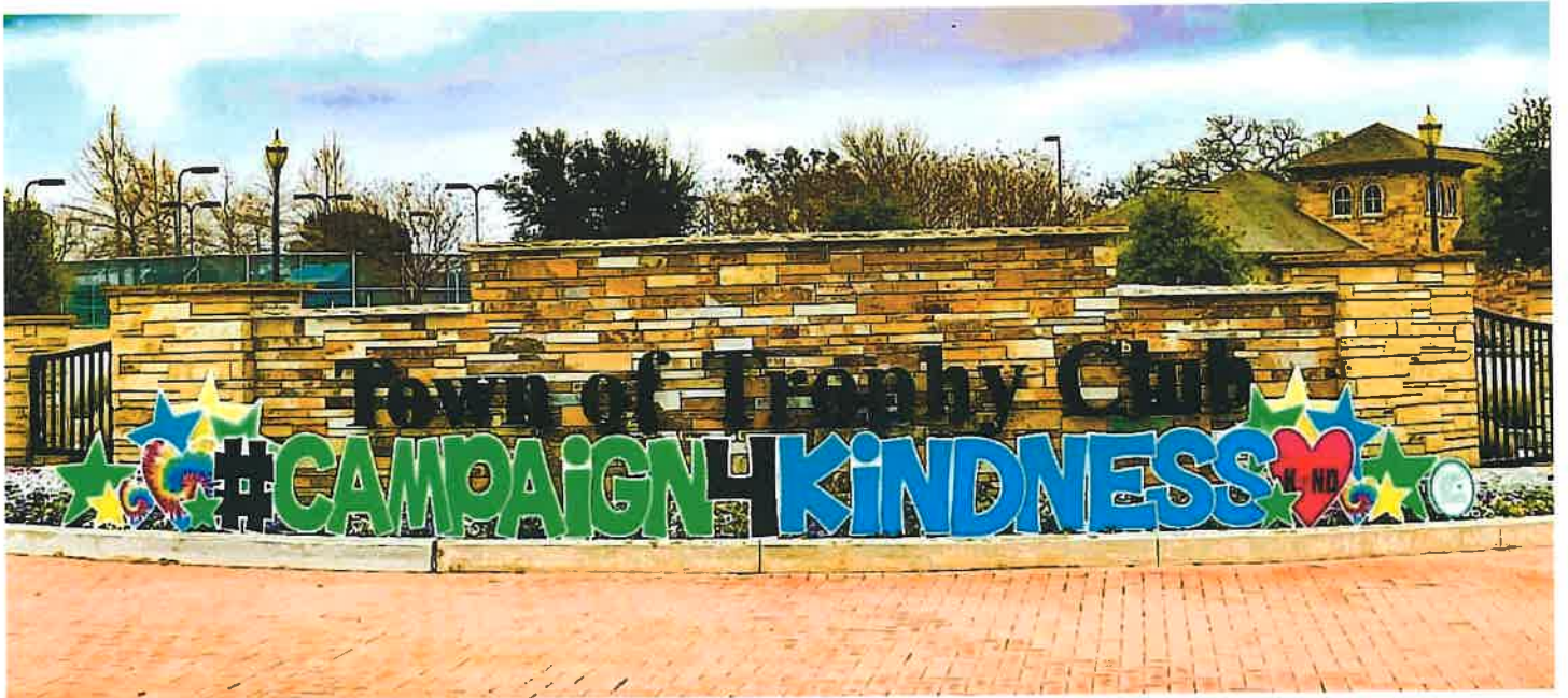
(pictured: signage given from the town of Trophy Club for Kindness Month)