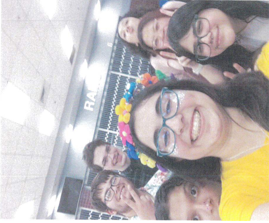
An after clean-up picture of the event, showcasing members of our Student Council who volunteer to clean and rearrange all tables back to their places.