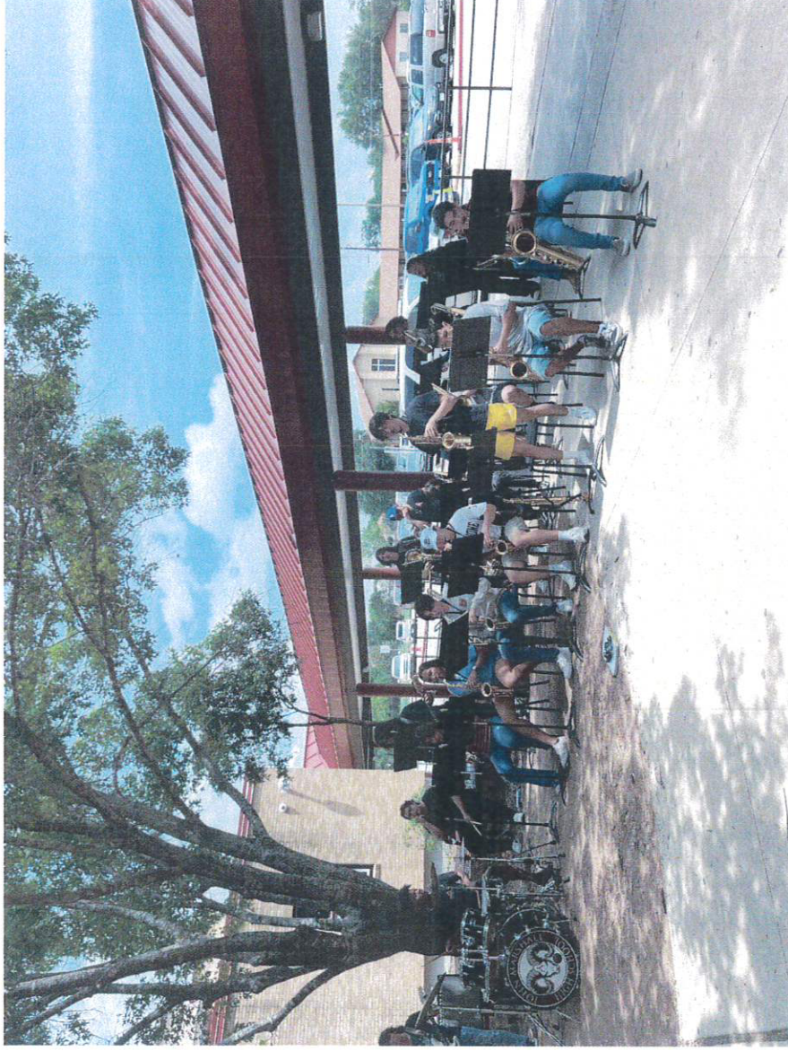
Picture promoting more of our schools organizations, which volunteer to put on a performance during the day.