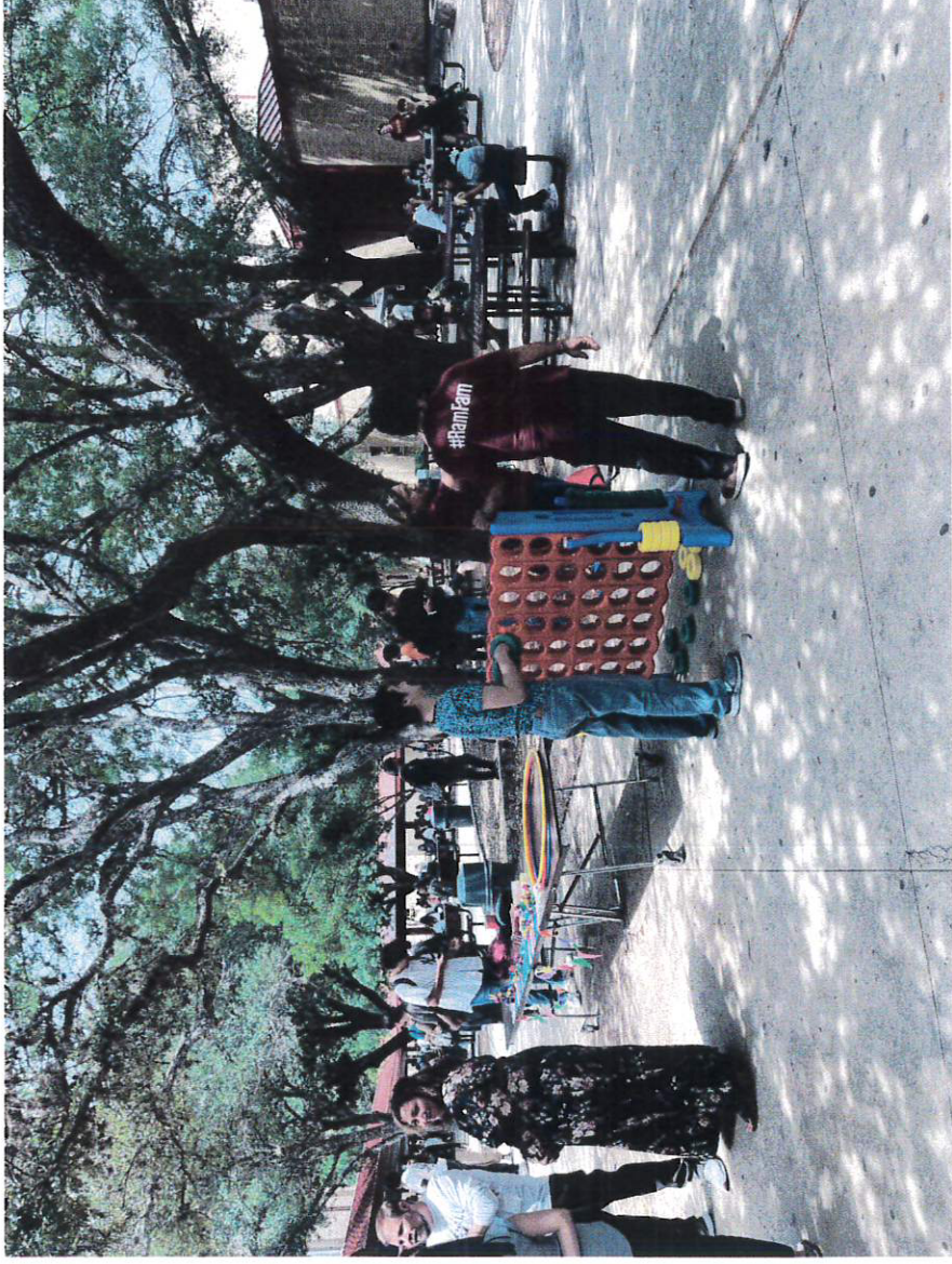
This picture showcases some of the activities offered during Spring Fling by the different organizations.