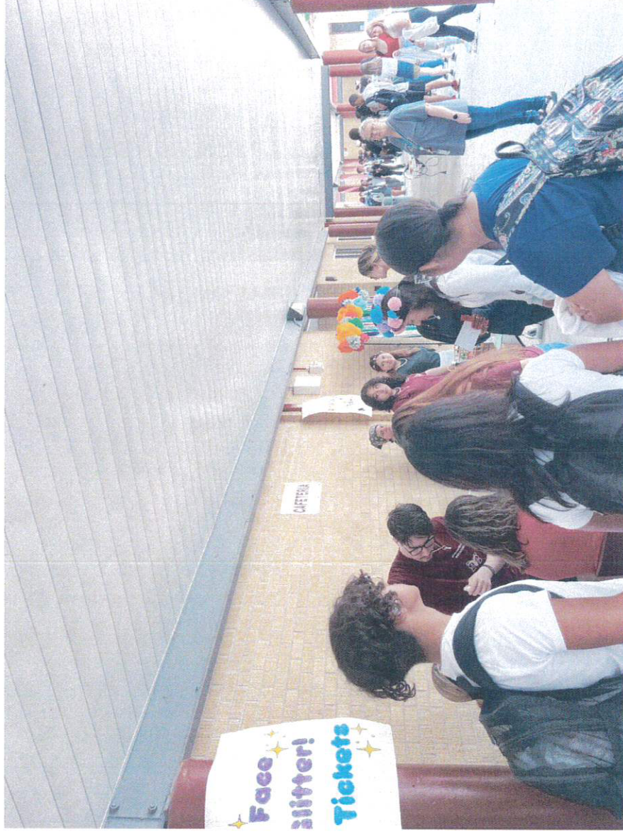
Picture showcasing all the student body participation as well as the participation from multiple school organizations.