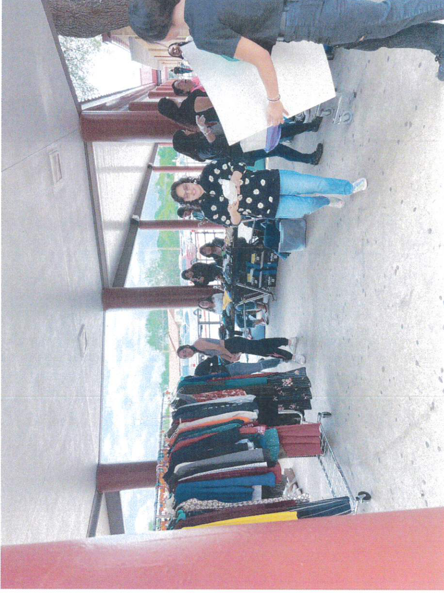
This pictures promotes the participation of another school organization with a school "thrift shop" where students could buy lighting use clothes, shoes and accessories.